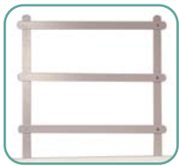
3-Tier Back Rail (MD30-RBR3)