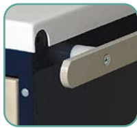
(3) 12" Side Rails (SIDERAIL12)