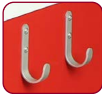
(2) Utility hooks (UHOOKS2)