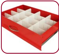
(2 Sets) Standard 6" Drawer Dividers (MD30-DIV6-S)