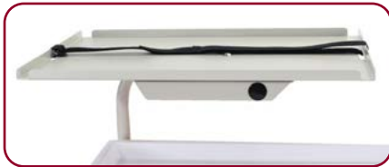
Defibrillator Shelf (MD-DEFIB)