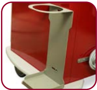
Oxygen tank holder (O2HLDR)