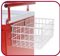
Large Utility Basket (BASKETDM)