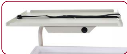
Defibrillator Shelf (MD-DEFIB)