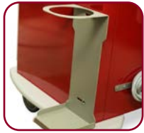
Oxygen tank holder (O2HLDR)