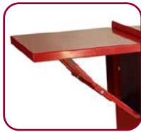
Drop shelf (MD-DRPSHLF)