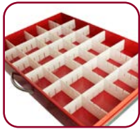
(1 Set) Standard 3" Drawer Dividers (MD30-DIV3-S)