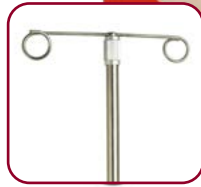
IV pole (MD-IV2)