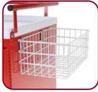
Large Utility Basket (BASKETDM)