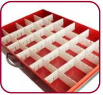
(2 Sets) Standard 3" Drawer Dividers (MD30-DIV3-S)