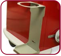
Oxygen tank holder (O2HLDR)