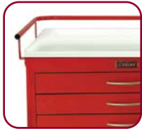
Toprail, matching cart color (MD30-TOPRAIL)