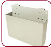
Chart Holder (CHARTHLDRDM)