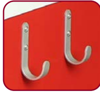
(2) Utility hooks (UHOOKS2)