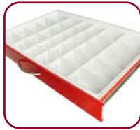
(1 Set) Standard 3" Drawer Tray Dividers (MD30-TRAYDIV3-S)