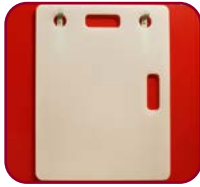
Cardiac board and brackets (MD-CARDBRD)