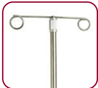
IV pole (MD-IV2)