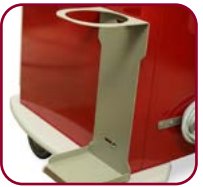
Oxygen tank holder (O2HLDR)