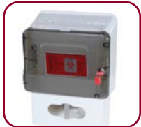
Locking Sharps Container (5qt) and Glove Box Holder (LKSHRPHOLD5Q-GLV)