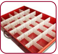
(2 Sets) Standard 3" Drawer Dividers (MD30-DIV3-S)