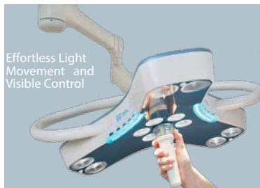
Effortless Light Movement and Visible Control